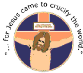
The Gospel of Philip

The Hypes of "Christ" - just Monkey's Fuss for Fl ops n' Sl obs